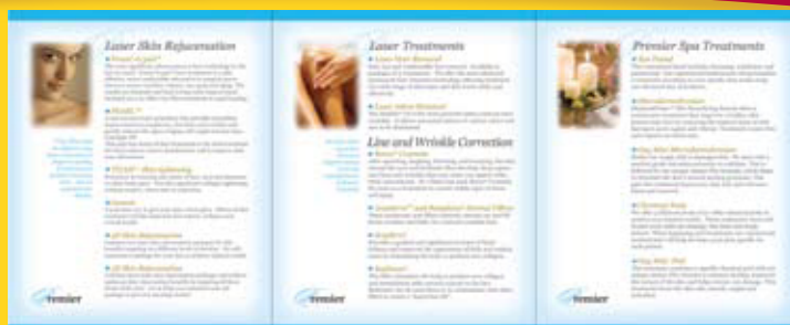
Premier Dermatology Brochure

"Everyone is raving about how BEAUTIFUL our new brochure is! We absolutely love them. It was soooo worth the effort!"